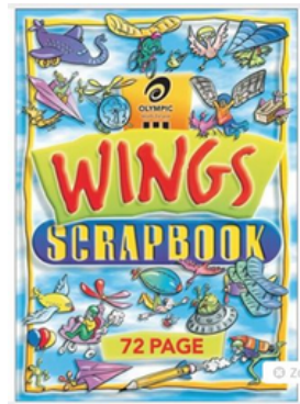
Blank White Scrapbook 335 x 240mm 72 PAGES