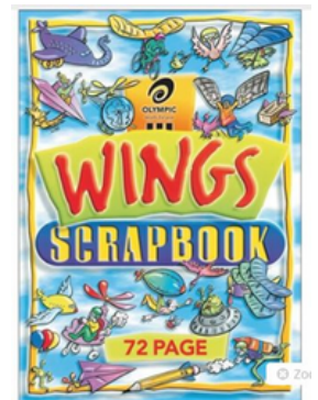
Blank White Scrapbook 335 x 240mm 72 PAGES