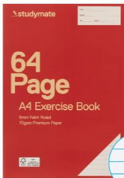
A4 Exercise Books Feint Ruled 8mm 64 PAGES