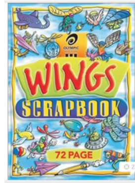
Blank White Scrapbook 335 x 240mm 72 PAGES