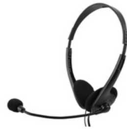
Either a 3.5mm Jack (type TRRS) or USB