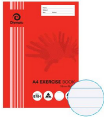
A4 Exercise Book 8mm Feint Blue Lined 48 PAGES