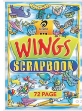
Blank White Scrapbook 335 x 240mm 72 PAGES