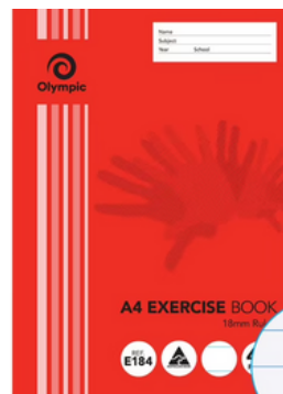
A4 Exercise Book 18mm wide lines