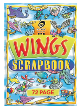
Blank White Scrapbook 335 x 240mm